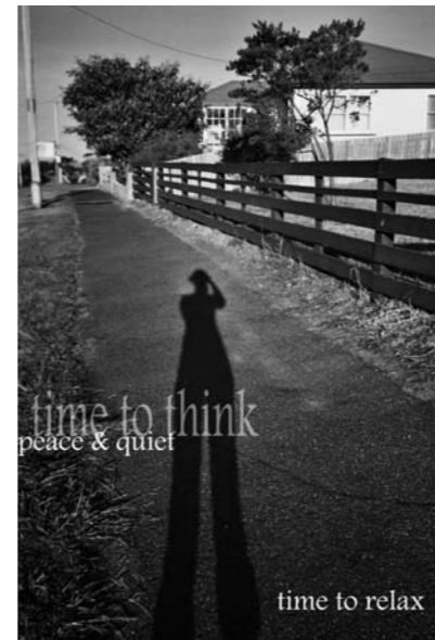
Flash 15