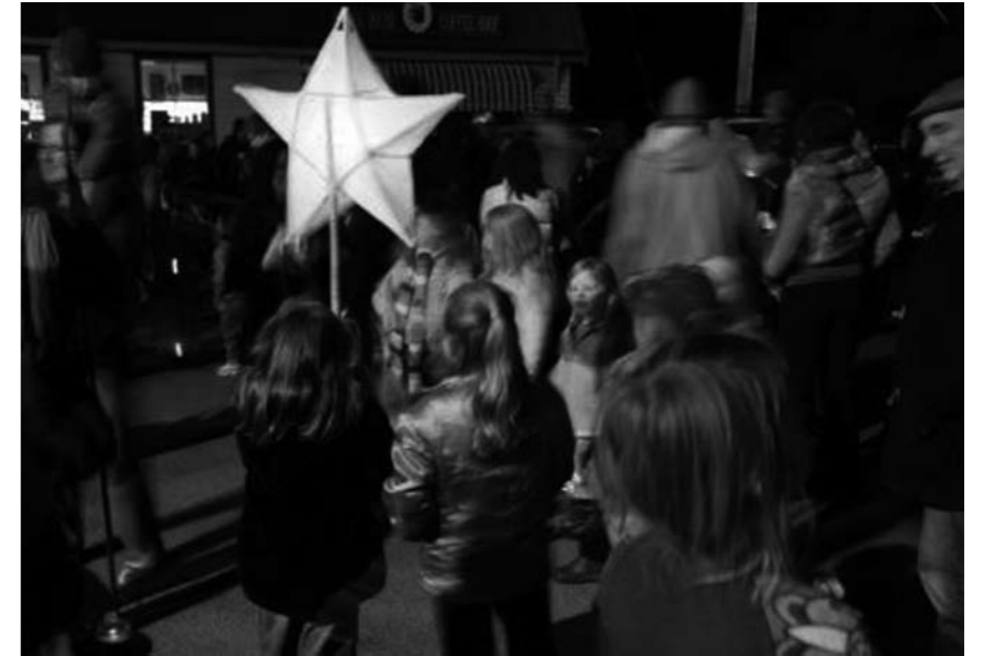
Cygnest Solstice parade

The bringing together of lanterns and the winter solstice has been gaining in popularity in multi cultural western communities over the last ten to fifteen years. In Canada the annual December winter solstice lantern procession in Vancouver started as a three-month funded artist-in-residence project and is still going 12 years later. In our usual Aussieness we have made our own upside down version in June. From what I can gather the winter solstice is basically trusting in the wheel of the seasons to keep turning and that the sun will get warmer again and help the crops to grow. The historical celebrations also indicate that the winter solstice is about celebrating family and gathering your community close in the cold and dark.