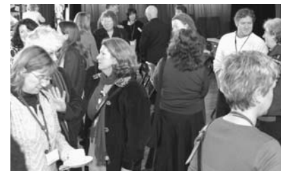
Delegates viewing displays over coffee