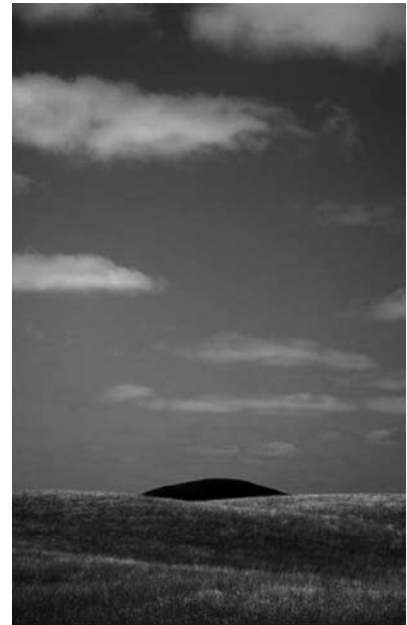
Duncan Thomas - Strait Across King Is

In 2006 TRA assisted King Island Cultural Centre and Flinders Is Arts to develop the Strait Across - Inter Island Arts Exchange. The project involved curatorial support for artists in the community and the development of parallel exhibitions on both Islands in late 2006.