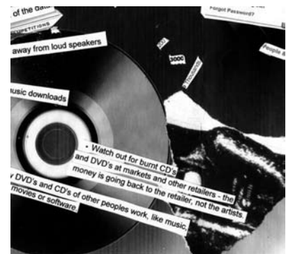
Techno Safe zine

The Northern Midlands Council approached TRA mid 2006 to help coordinate a project about the uses and abuses of technology like the internet and mobile phones called "Techno - Safe". The project involved filming and editing a media snippet and creating graphics and content for a zine. Karlee conducted 9 workshops at Cressy with 6 students, one of which included hands-on training with Southern Cross TV assistant editor (and young person) Stacey Eastoe. The media snippet and the zine were successfully launched at both Cressy District High and Campbell Town District High in December 06.