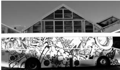
Streets Alive Bus, photograph: Kim Schnieders

COMMUNITY BASED ARTS - YOUTH, WELLBEING, COMMUNITY